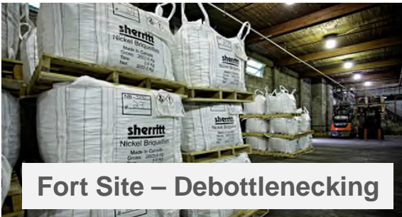
Fort Site – Debottlenecking