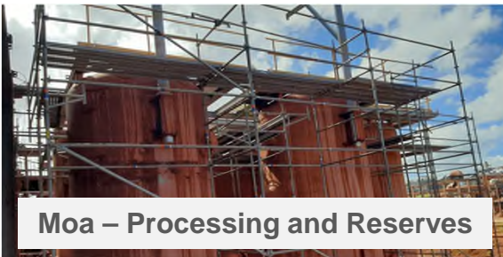
Moa – Processing and Reserves