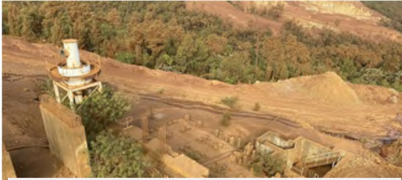
Moa – Slurry Preparation Plant